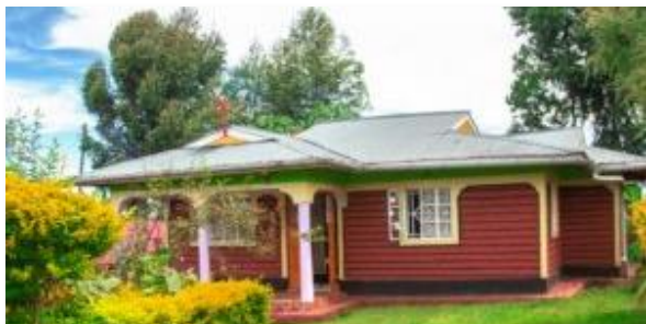
Welcoming the sick & suffering in Jesus' name

The demand of suffering children exceeds our capacity!